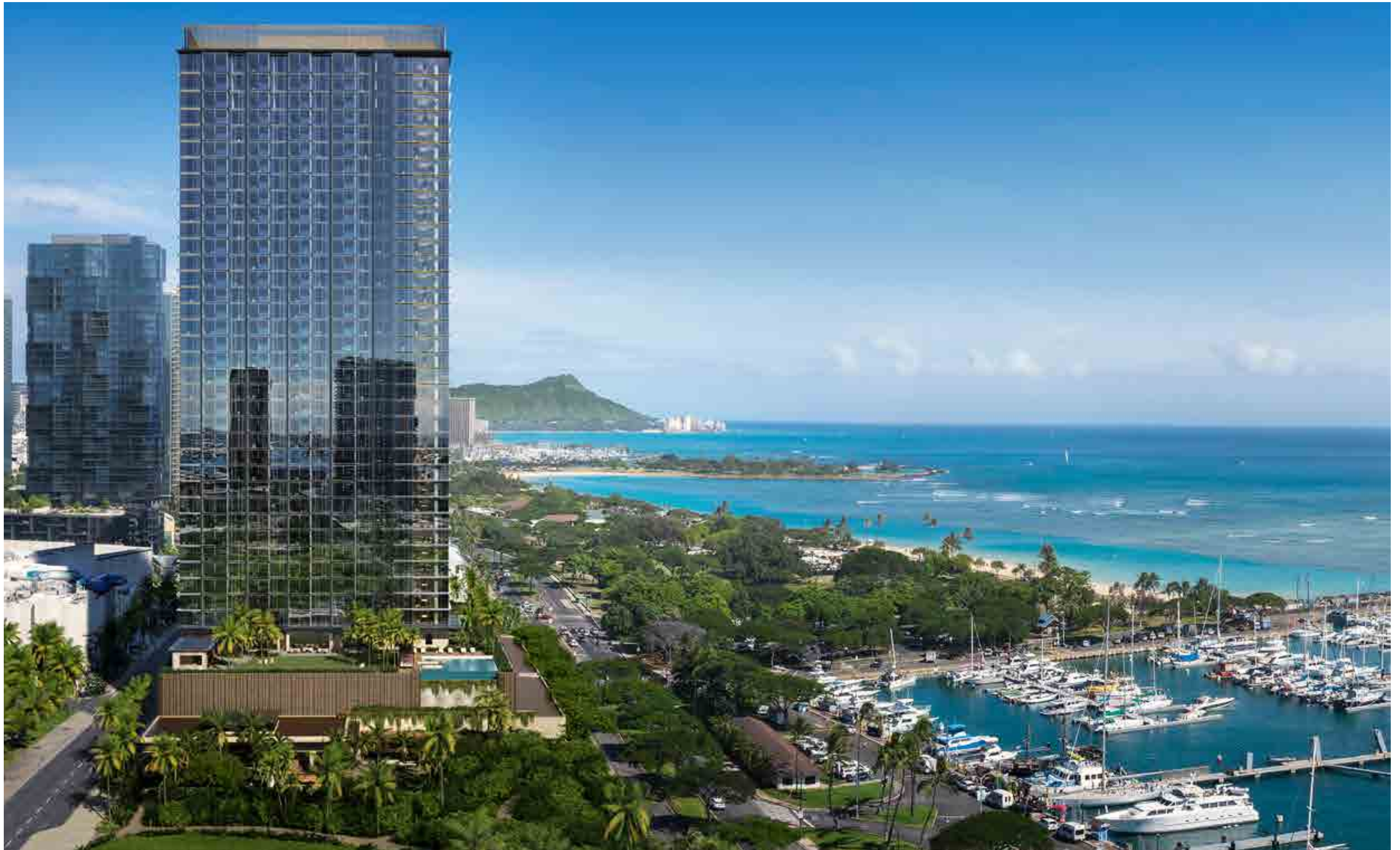
WARD VILLAGE & KEWALO HARBOR Named "Best Planned Community" by Architectural Digest, Ward Village offers residents and visitors all the charm and luxuries of a neighborhood designed with care and vision.