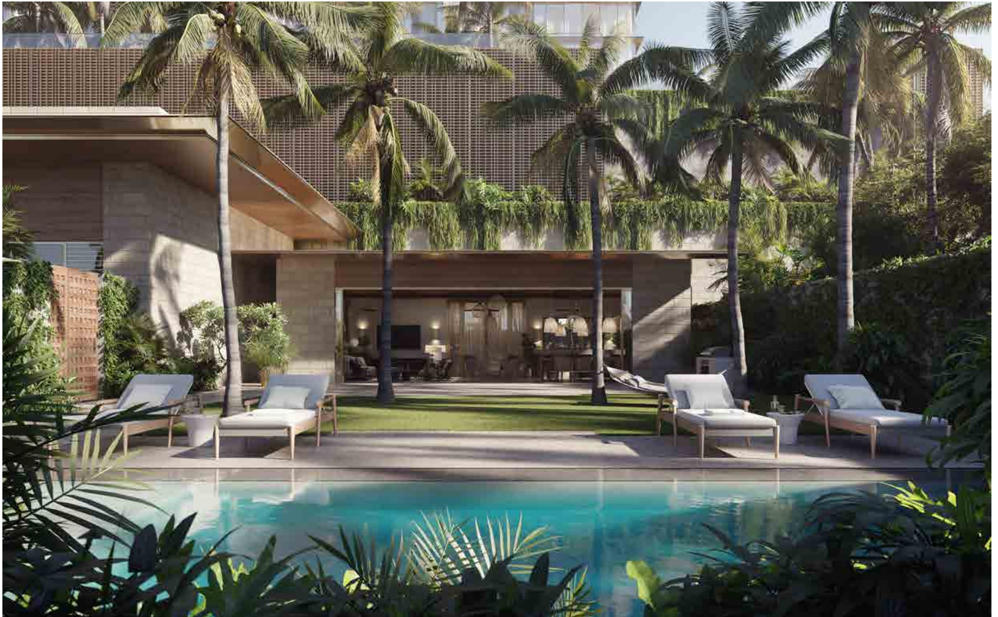
LAUHALA POOL HOUSE A sophisticated and private gathering space provides the ideal indoor-outdoor setting to celebrate life's special moments.