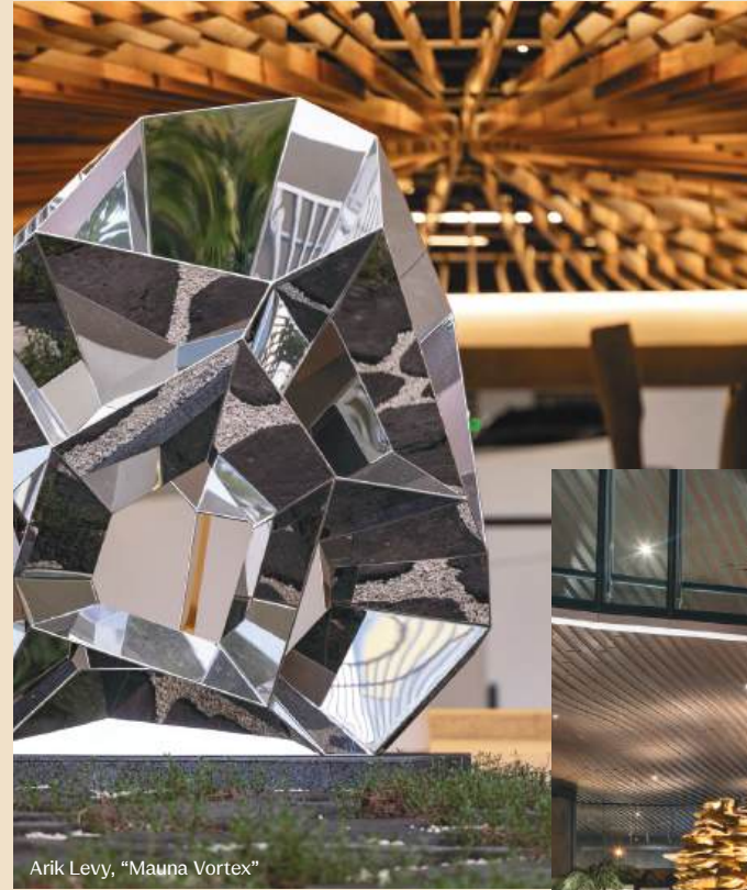
Arik Levy, "Mauna Vortex"

Ward Village showcases a variety of contemporary art by acclaimed local and international artists throughout the neighborhood. The array of installations, sculptures, and murals enhances the streetscapes and inspires residents and the larger community daily. Each residence also features its own unique collection of artwork.