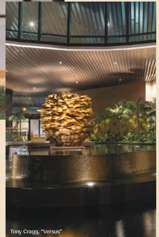
Tony Cragg, "Versus"

Ward Village showcases a variety of contemporary art by acclaimed local and international artists throughout the neighborhood. The array of installations, sculptures, and murals enhances the streetscapes and inspires residents and the larger community daily. Each residence also features its own unique collection of artwork.