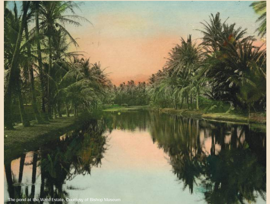
The pond at the Ward Estate

For more than a century, Victoria Ward and her family were stewards of this land, maintaining a peaceful sanctuary between Honolulu and Waikīkī. In 2010, Howard Hughes assumed responsibility of Ward Village, building on Victoria Ward's legacy and continuing her mission of creating a neighborhood and gathering place that embraces all.