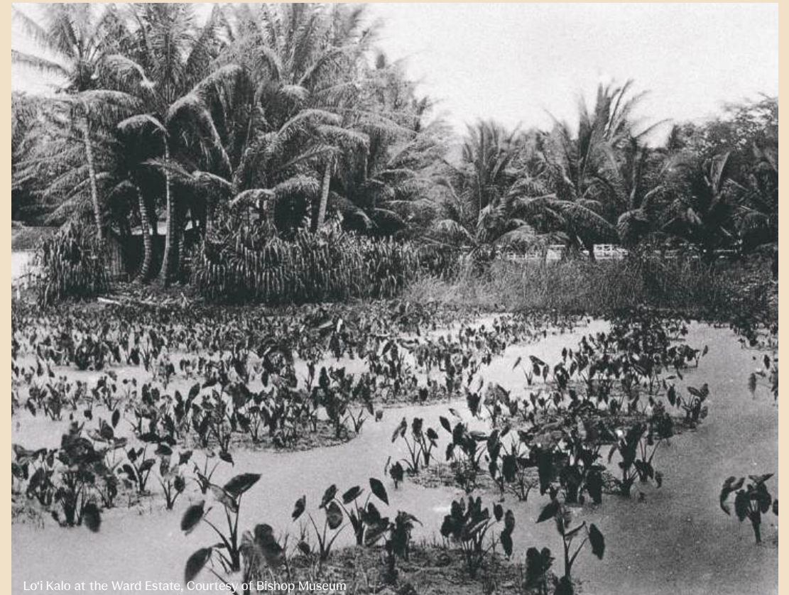
Lo'i Kalo at the Ward Estate